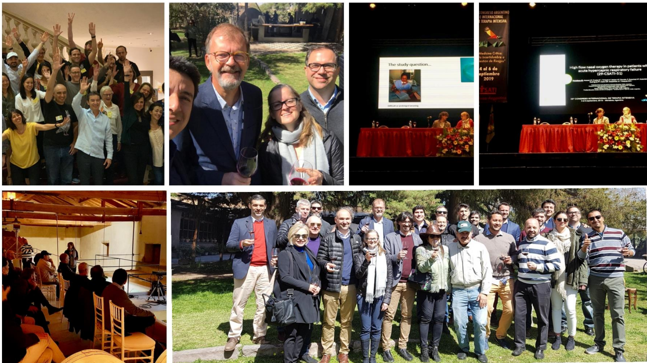
Some pictures from Argentinian Conference of Intensive Care Medicine 2019