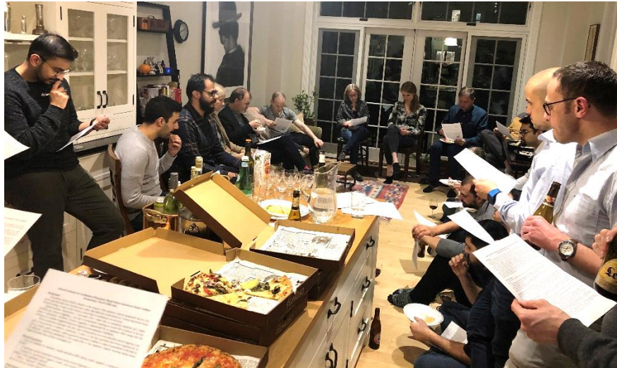
Picture: CRIP session on Dec 3, 2019

A unique aspect of the IDCCM, CRIP is held approximately once a month from September through May. These sessions are hosted by different faculty, who invite all members of the IDCCM to their home for an evening of pizza and research. Each session provides an opportunity for two research presentations, with moderated discussion and feedback regarding the proposed research projects. Presentations are encouraged from both junior (trainee) and senior members of the IDCCM.