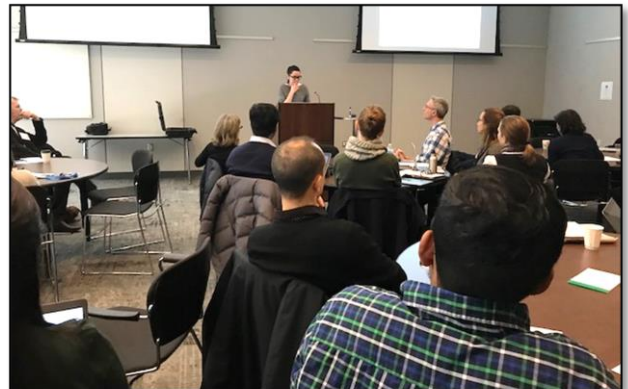
Picture: NABOR session 2018